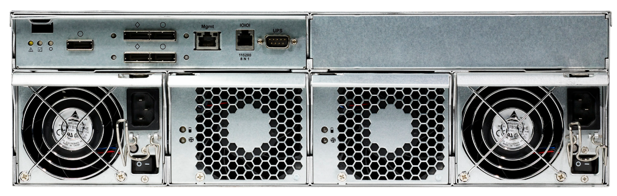
Avid VideoRAID SR back