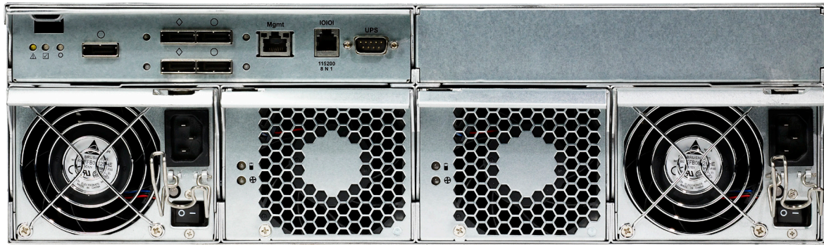
Avid VideoRAID SR back